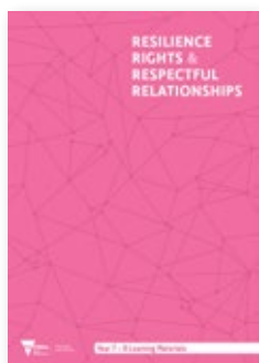
Level 7 – 8