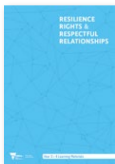
Level 3 – 4