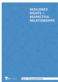
Level 9 – 10