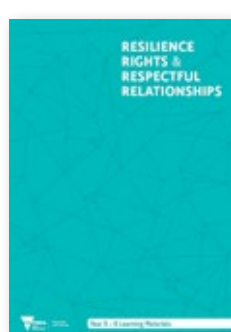
Level 5 – 6